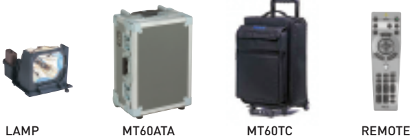
LAMP MT60ATA MT60TC REMOTE